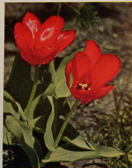
RED EMPEROR (Species)